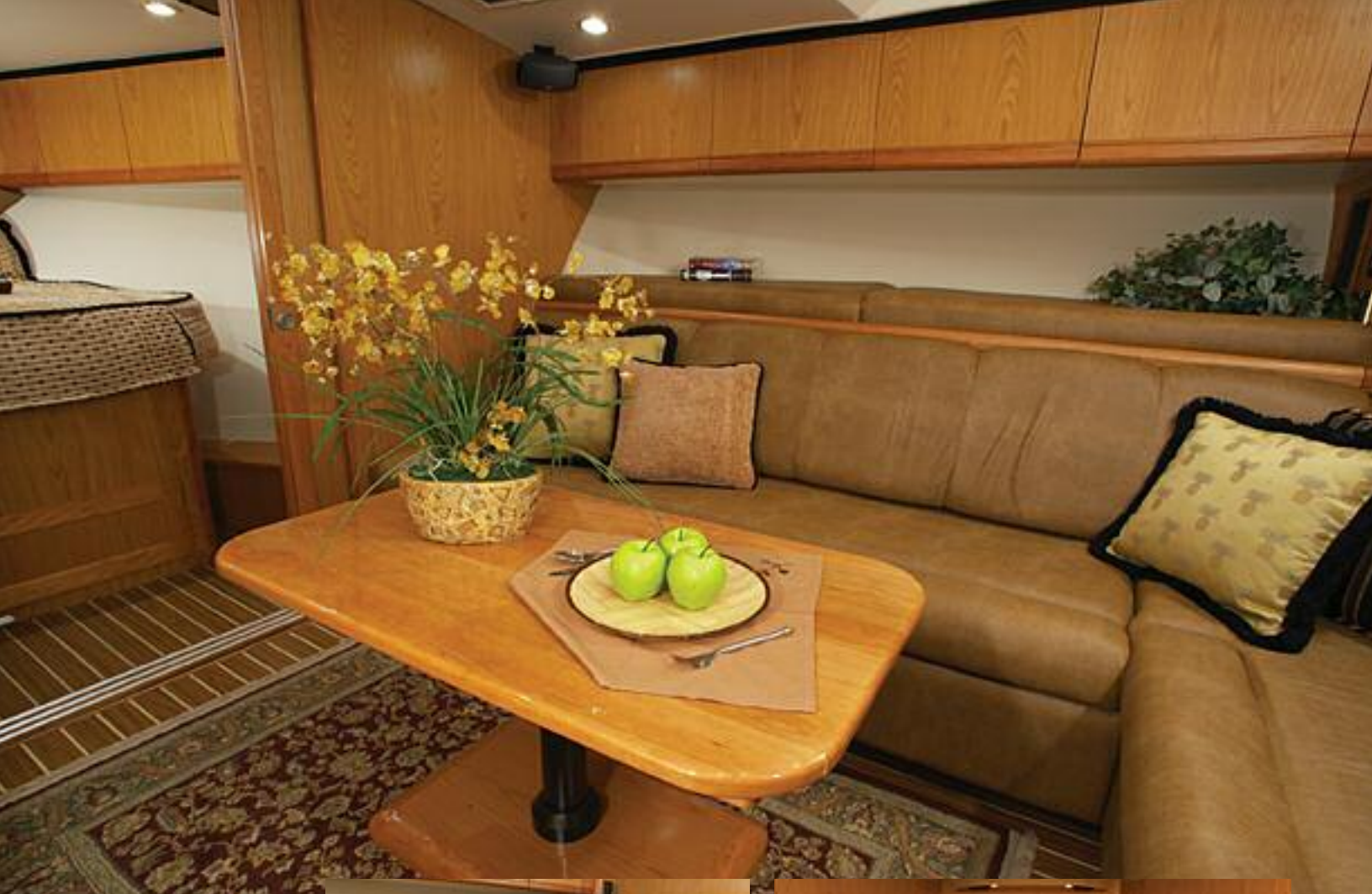
Above: The 41 Open has a generously sized salon which opens directly to the master stateroom via sliding privacy doors.