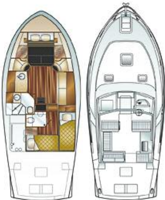
37 Canyon Series IPS Power: Twin Volvo IPS 500 or 600 Diesel Engines