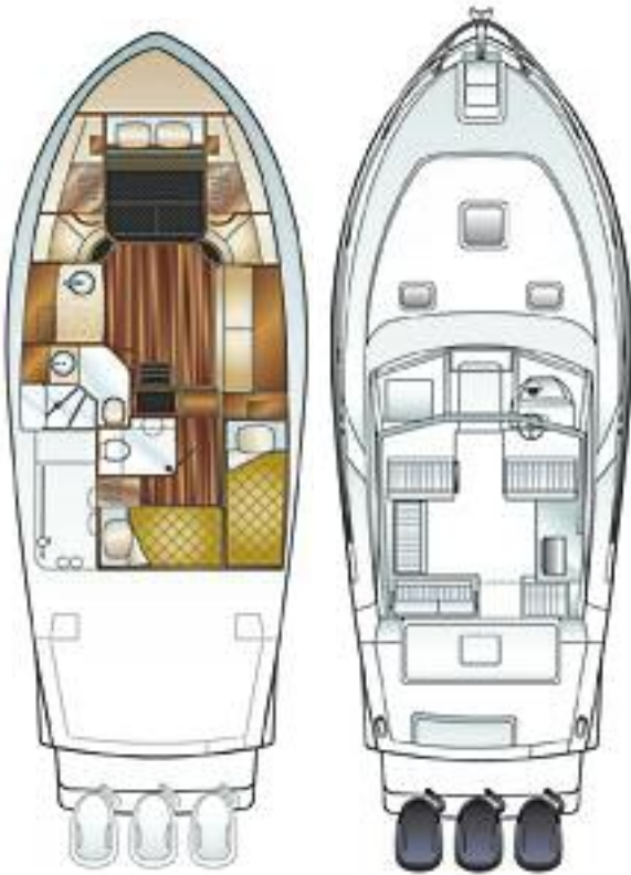
37 Canyon Series OB Power: Triple Yamaha V8 5.3L 350hp Outboards