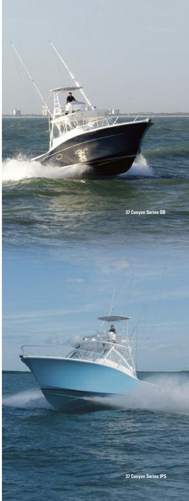
37 Canyon Series OB