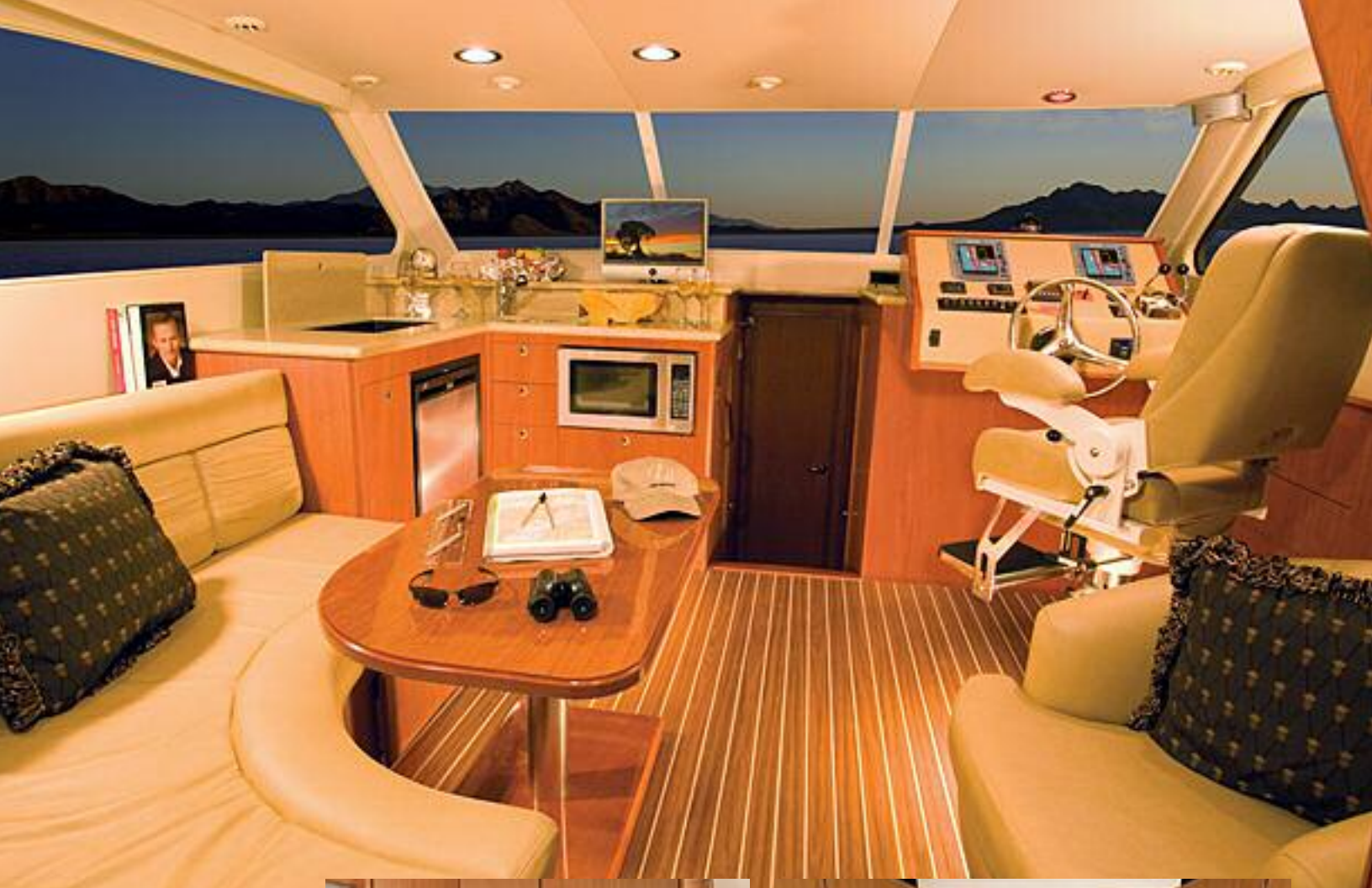
Above: The 35 Convertible features a standard windshield, creating an airy, open salon. Shown also is the optional lower helm.