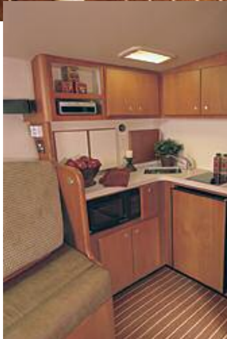
Above Middle: The galley comes complete with Corian® countertops, one burner electric stove, microwave oven, top loading refrigerator and a stainless steel sink.