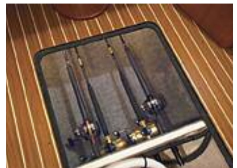
Below Right: Rod storage is cleverly hidden in the salon sole, making for an uncluttered layout.